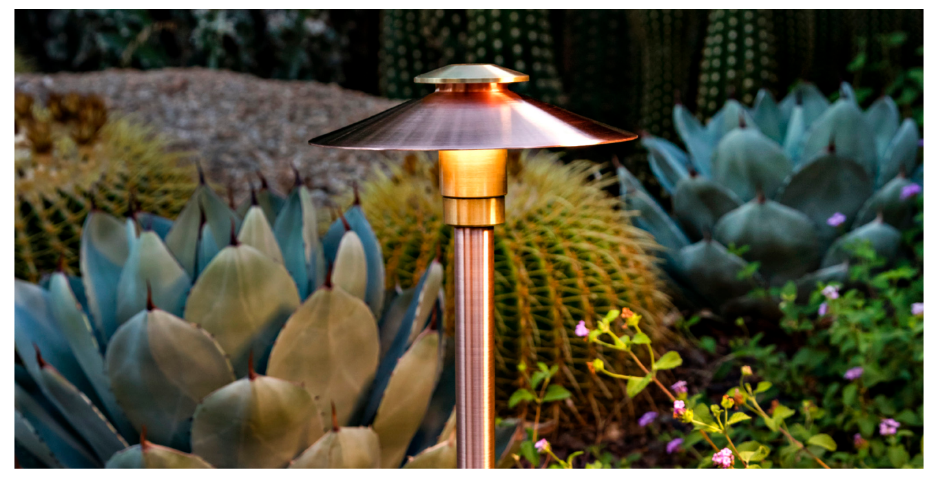
Application picture shown as SEQUOIA-PL-7-G4-CU-F (not in Amber).