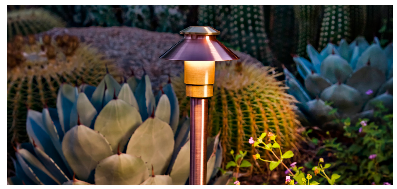
Application picture shown as ZION-PL-4-G4-CU-F (not in Amber).