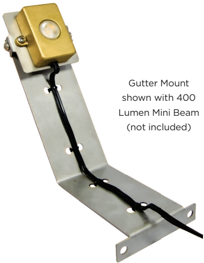
Gutter Mount shown with 400 Lumen Mini Beam (not included)