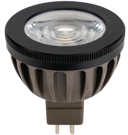
Part Number: RC-MR16