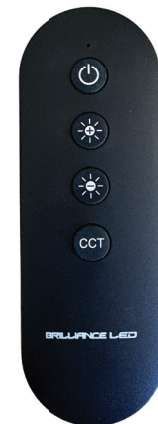
Short Range Remote ( sold separately )